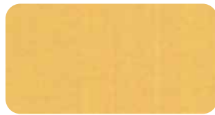
SC5333 Mango Cotton Couture 5" x 15" piece