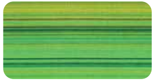
DC5377 Grass Siren Song 3/4 yard