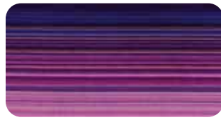
DC5377 Twilight Siren Song 3/4 yard