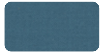
SC5333 Marine Cotton Couture 5/8 yard