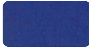
SC5333 Malibu Cotton Couture 5" x 15" piece