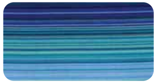
DC5377 Wave Siren Song 3/4 yard