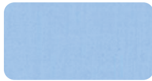
SC5333 Boy Cotton Couture Fat 1/8