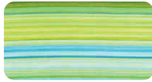
DC5377 Caribbean Siren Song 3/4 yard