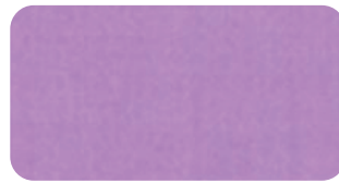
SC5333 Lavender Cotton Couture Fat 1/8