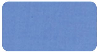
SC5333 Sailor Cotton Couture Fat 1/8