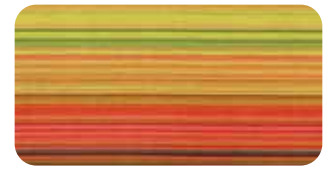
DC5377 Citrus Siren Song 3/4 yard