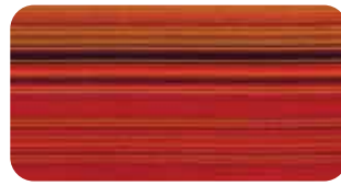
DC5377 Sunset Siren Song 3/4 yard