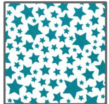
WV5719 Turq Super Stars (Backing) 3 yards