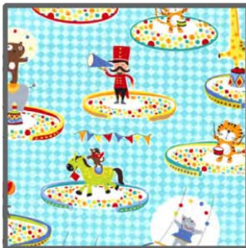
DC5714 Multi Three Ring Circus 3/4 yard