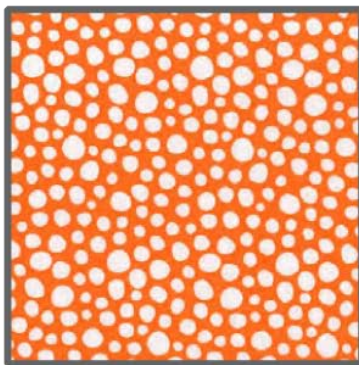
DC5718 Sunset Little Spots 1/4 yard