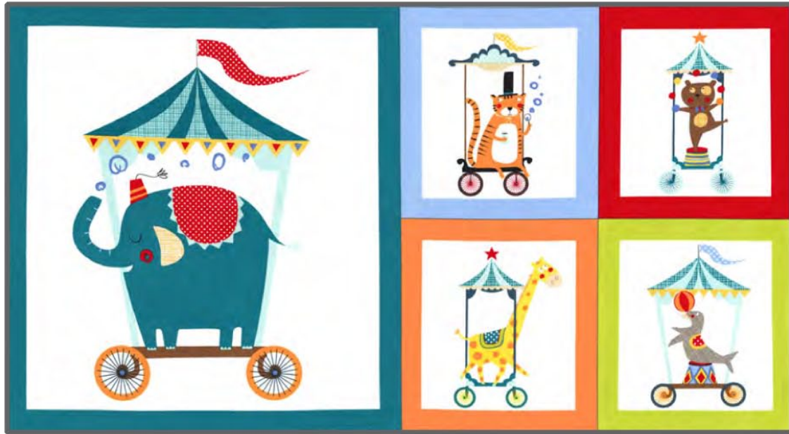
DC5713 Multi Fun at the Circus Panel 1 Panel