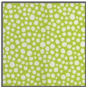
DC5718 Kryptonite Little Spots 1/4 yard