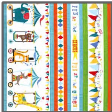
DC5712 Multi Circus Parade Border 3/4 yard