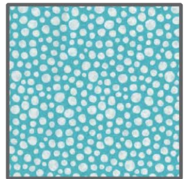
DC5718 Luna Little Spots 1/4 yard