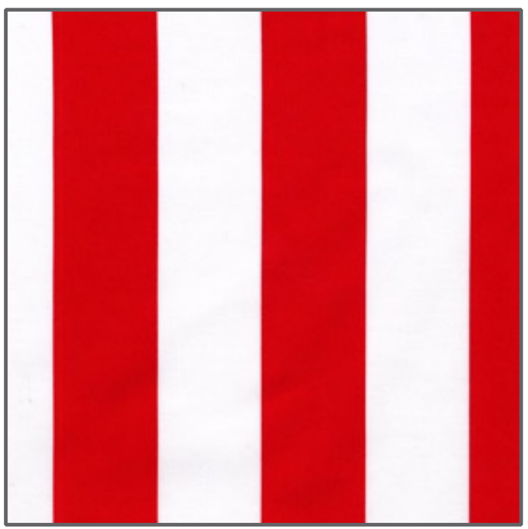
CX3745 Red Two by Two Stripe 2 1/2 yards