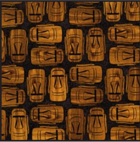
DC5441 Lava Tiki Winki 3/8 yard