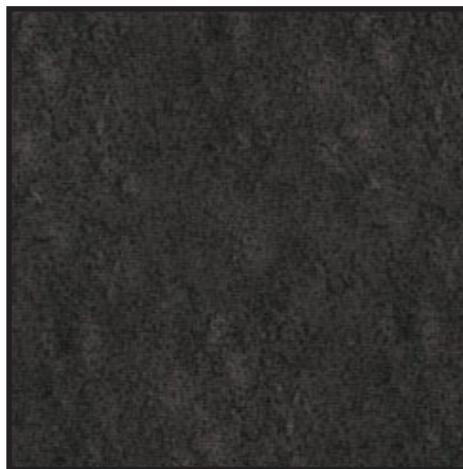
DC5218 Lava Gingerbread 1 yard