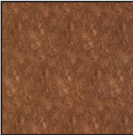
DC5218 Cocoa Gingerbread 5/8 yard