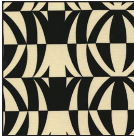
DC5443 Onyx Kimo 3/8 yard