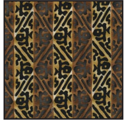
DC5012 Macnut Tiki Woodblock 3/4 yard