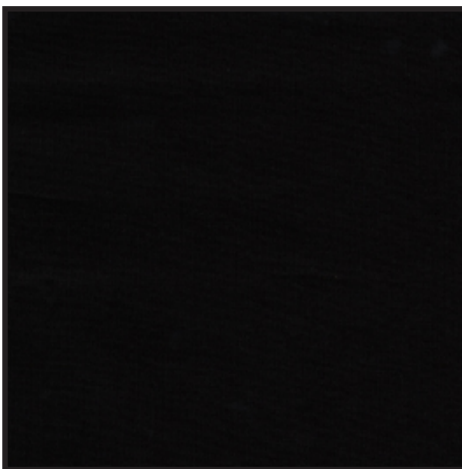
Jet Black 3/8 yard