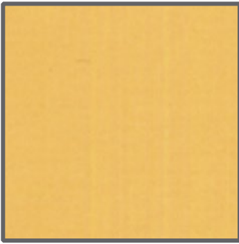
SC5333 Mango Cotton Couture 3/8 yard