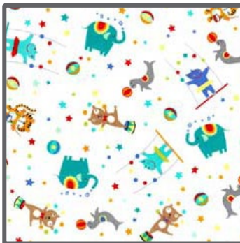
DC5715 Multi Mini Circus 1/2 yard