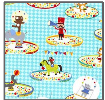
DC5714 Multi Three Ring Circus 1 yard