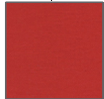
SC5333 Cherry Cotton Couture 1/2 yard