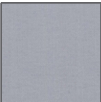
SC5333 Fog Cotton Couture Fat 1/4