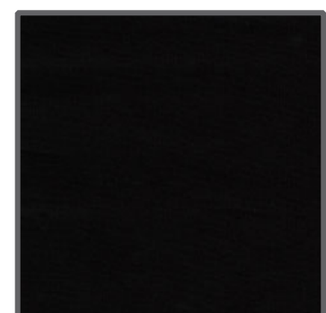
SC5333 Black Cotton Couture 2" square