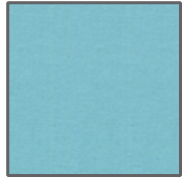
SC5333 Luna Cotton Couture 1/4 yard