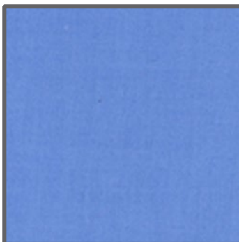
SC5333 Sailor Cotton Couture 6" x 11" piece