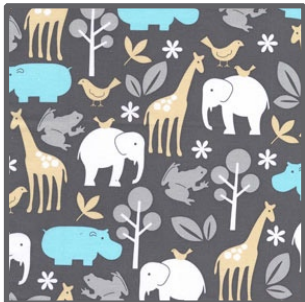
CX4061 Sea Zoology 1 1/4 yards