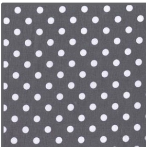
CX2490 Charcoal Dumb Dot 1/4 yard