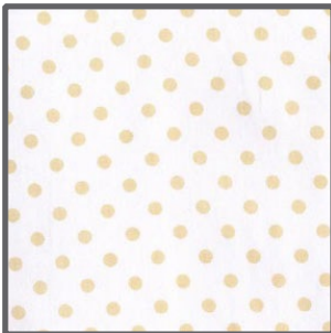
CX2490 Aulait Dumb Dot 1/4 yard