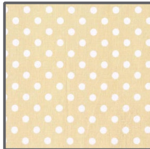
CX2490 Beige Dumb Dot 1/4 yard