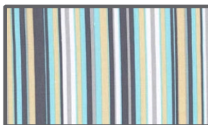
CX3137 Sea Play Stripe 1/3 yard