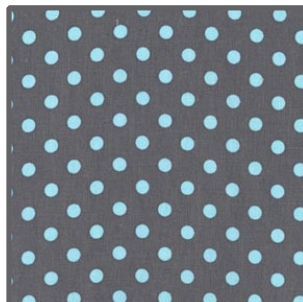
CX2490 Gray Dumb Dot 1/4 yard