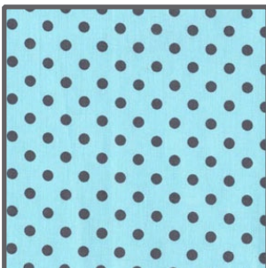
CX2490 Sea Dumb Dot 1/4 yard