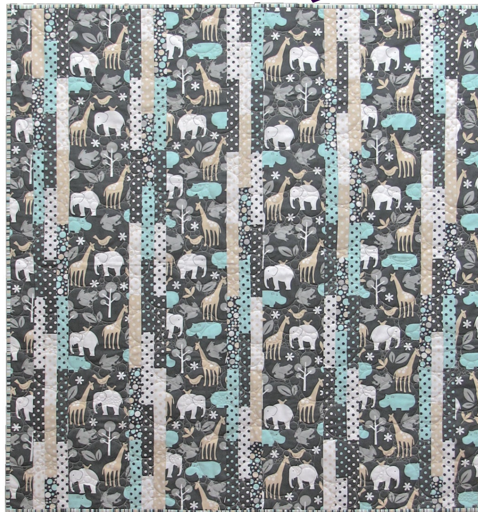
Size: 38"W x 41 1/2"H