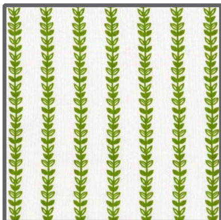
CX4534 Thyme Honey Vine 1/4 yard