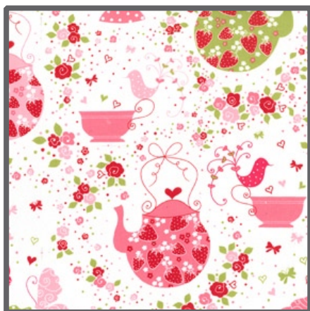
CX4903 Pink Strawberry Tea Party 1 3/8 yards