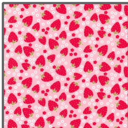
CX4905 Pink Blossom Berries 5/8 yard