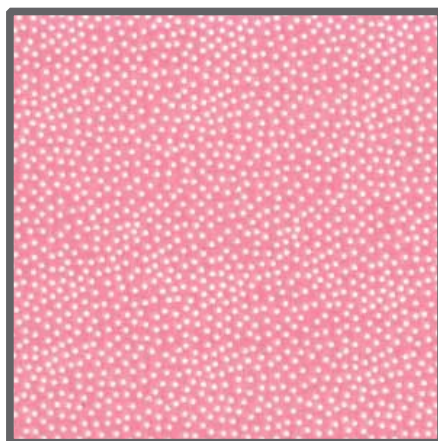
CX1065 Blossom Garden Pindot 3/8 yard