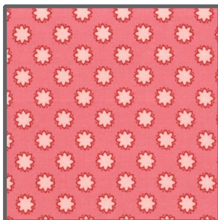
SH3514 Blush Vintage Dots 1/2 yard