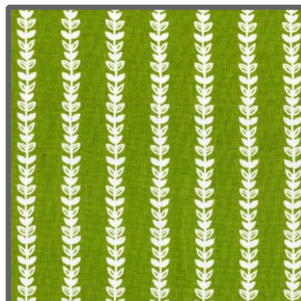
CX4534 Herb Honey Vine 5/8 yard