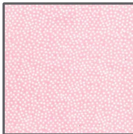
CX1065 Girl Garden Pindot 1/8 yard