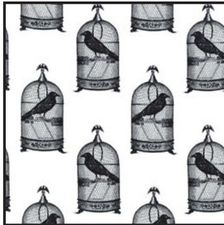
DC5523 White Jackdaws Fat 1/8