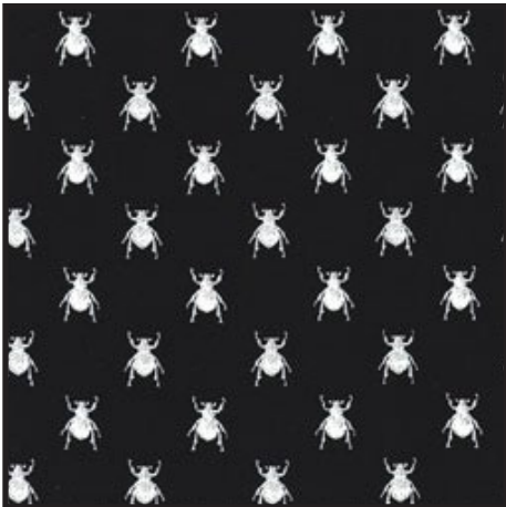
DC5524 Black Goth Bugs 1/2 yard