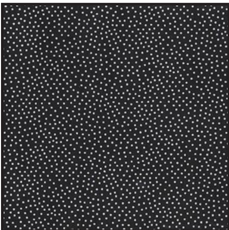
CX1065 Black Garden Pindot 1/2 yard