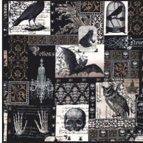
DC5522 Black Nevermore Collage 1 yard