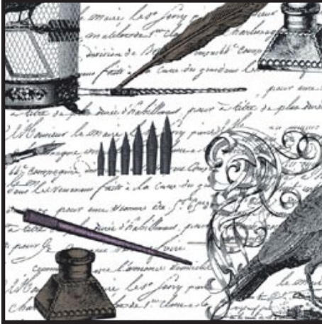
DC5525 White Edgar 1 yard