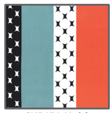
CX5451 Multi Atomic Stripe 1 1/4 yards