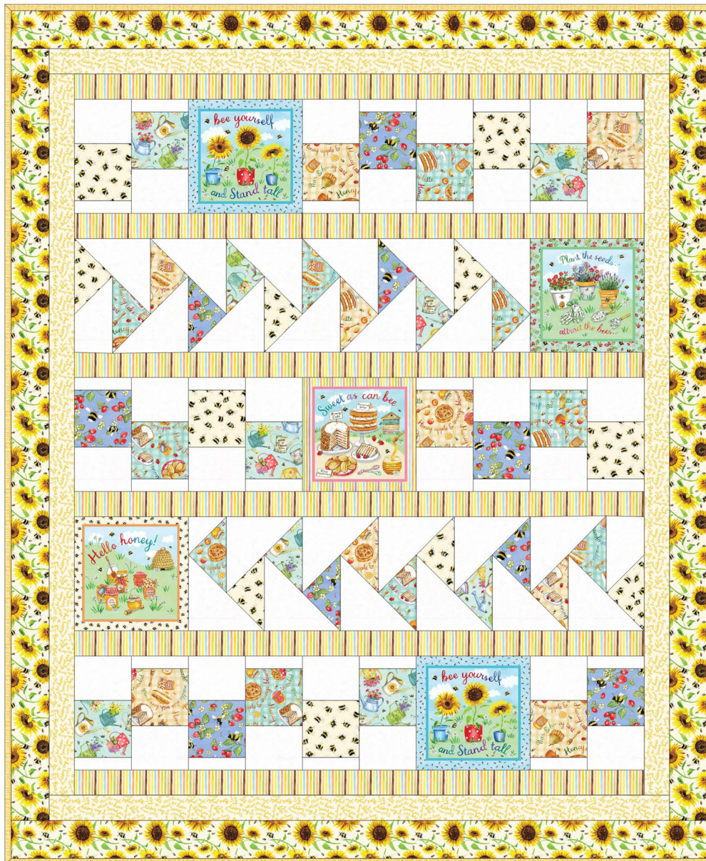
*THIS IS A DIGITAL REPRESENTATION OF THE QUILT TOP. FABRIC MAY VARY.