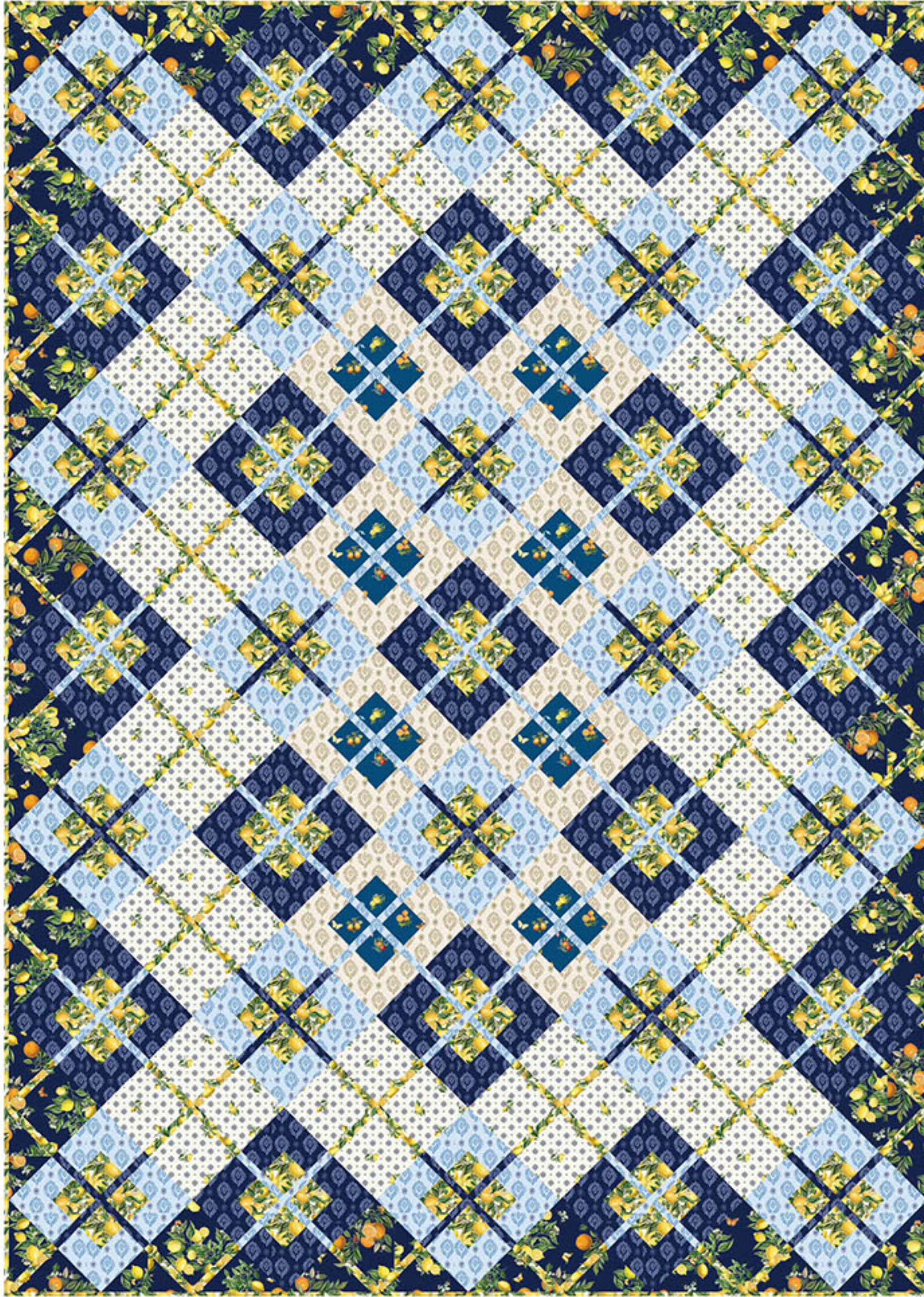
*THIS IS A DIGITAL REPRESENTATION OF THE QUILT TOP. FABRIC MAY VARY.