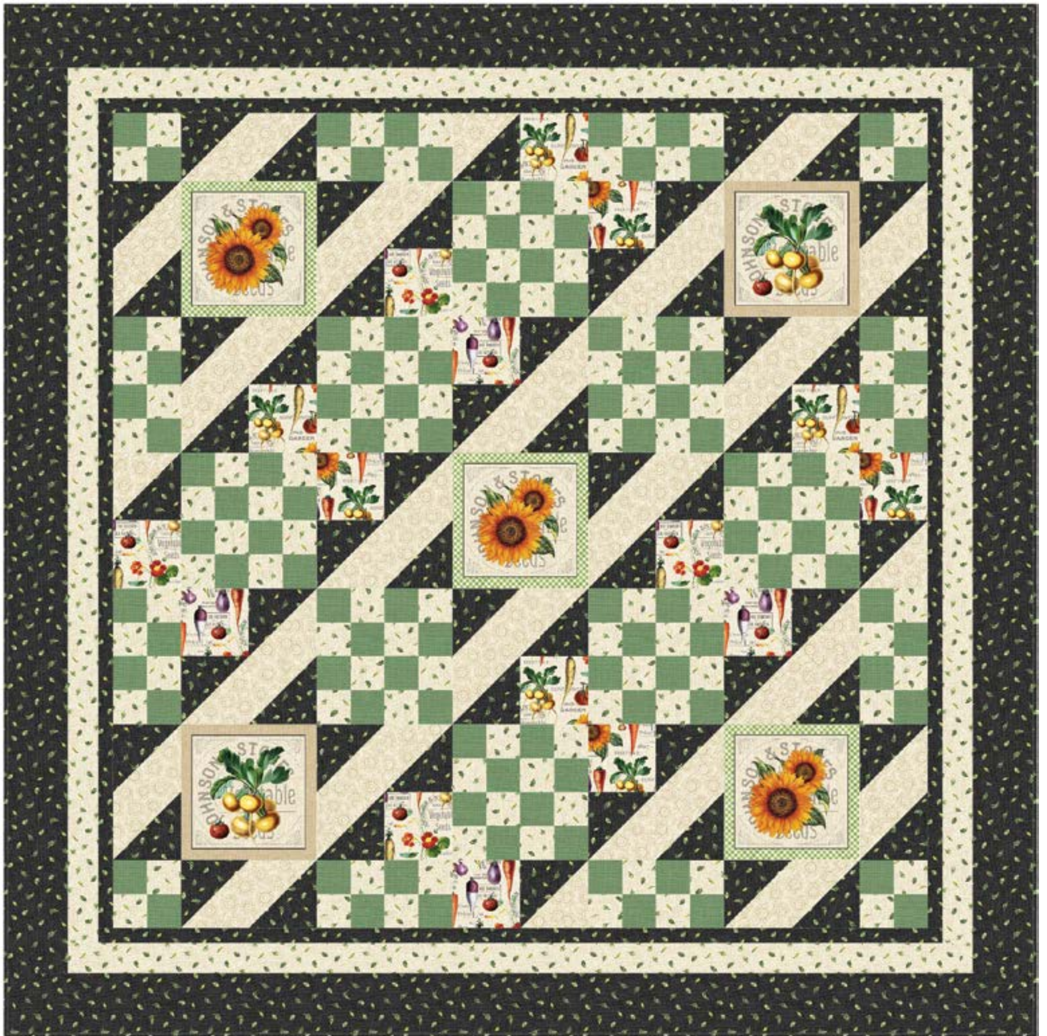
*THIS IS A DIGITAL REPRESENTATION OF THE QUILT TOP. FABRIC MAY VARY.

SIZE: 68 1/2"W X 68 1/2"H | LEVEL: MODERATE | PATTERN BY: BRENDA PLASTER COMMERCIAL PATTERN AVAILABLE AT WWW.PAYHIP.COM/BRENDAPLASTER & EE SCHENCK