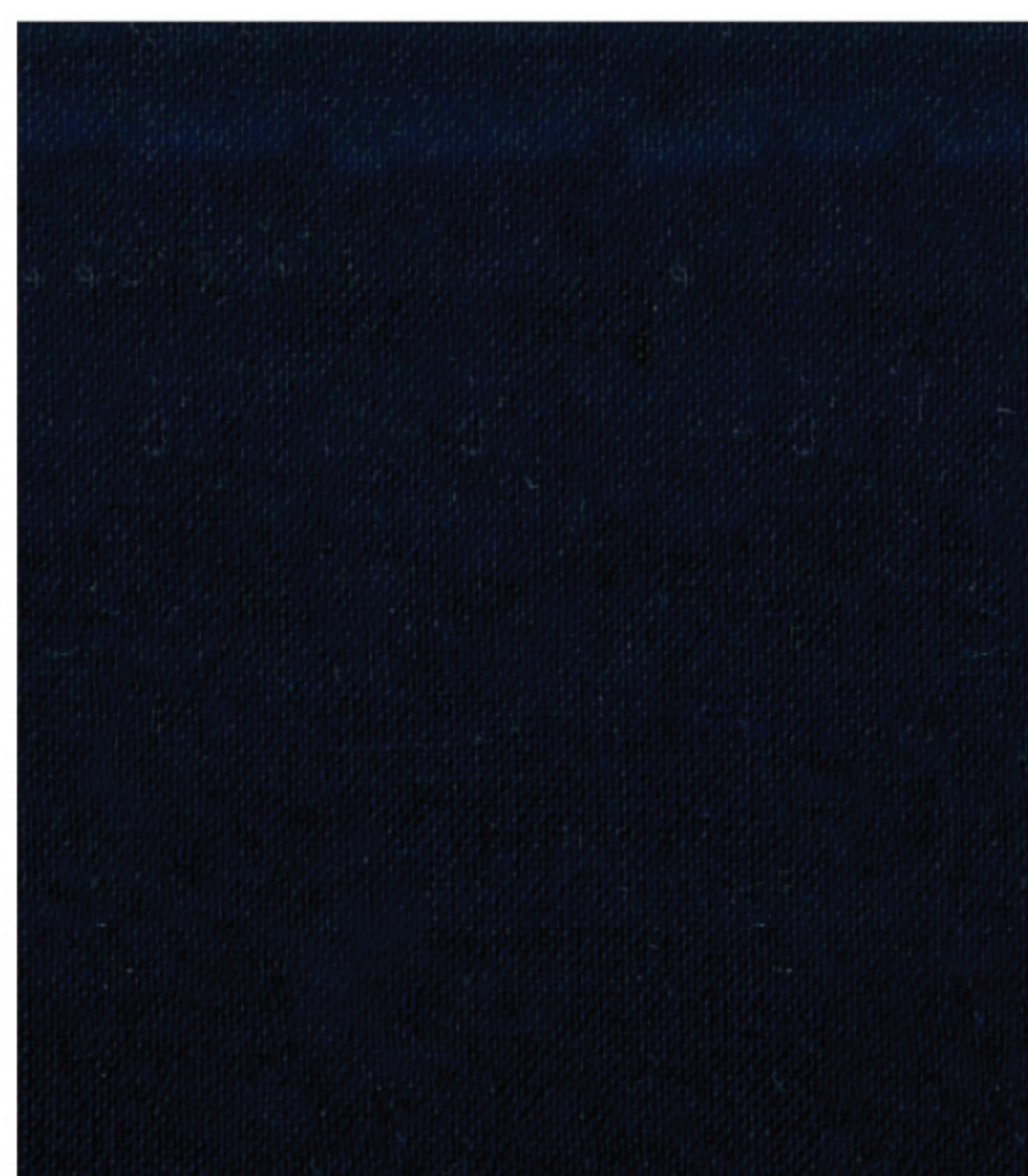
SC5333 INDIGO 2/3 YARD *BINDING*