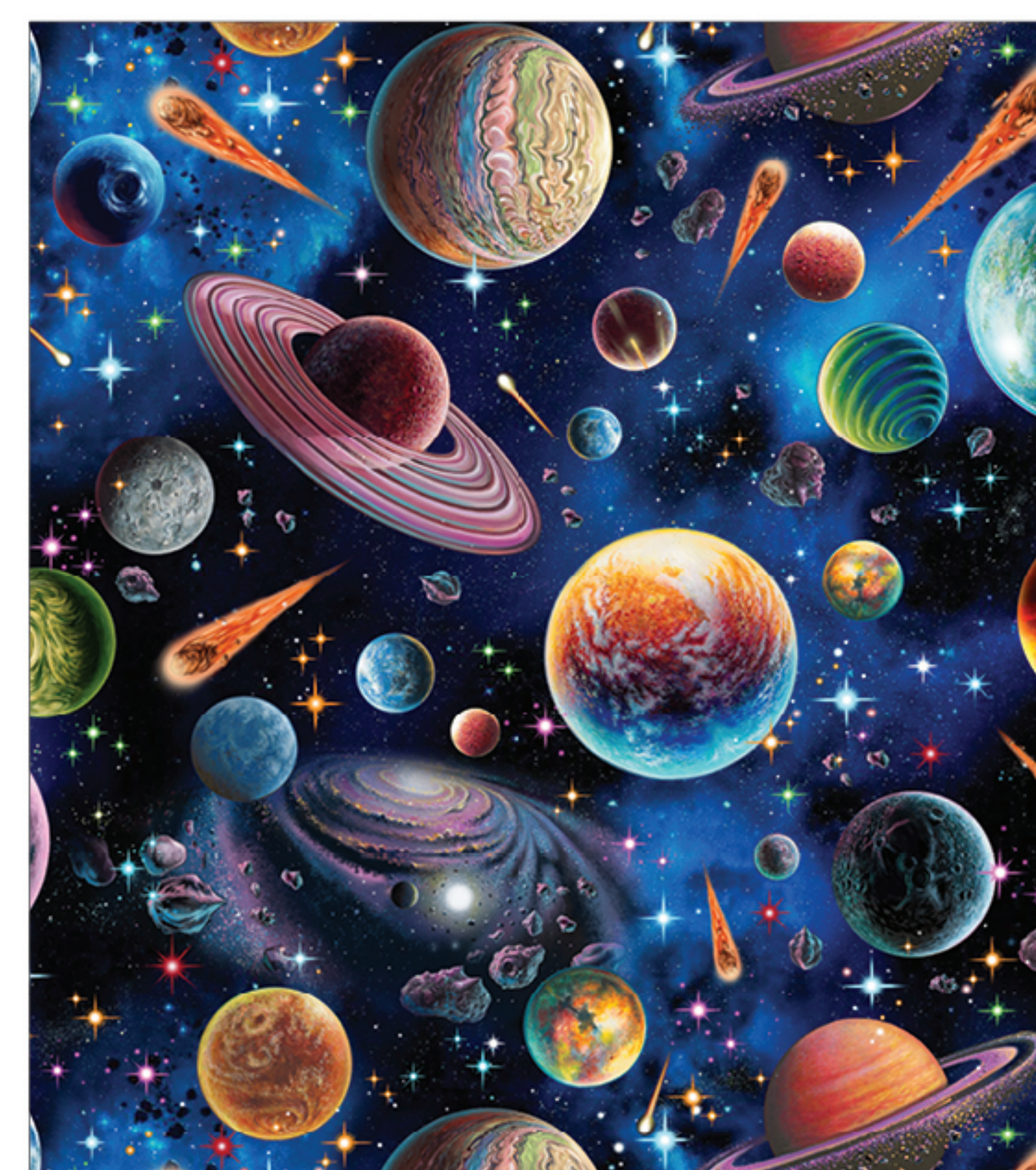
DDC11242 MULTI 5 YARDS *BACKING*