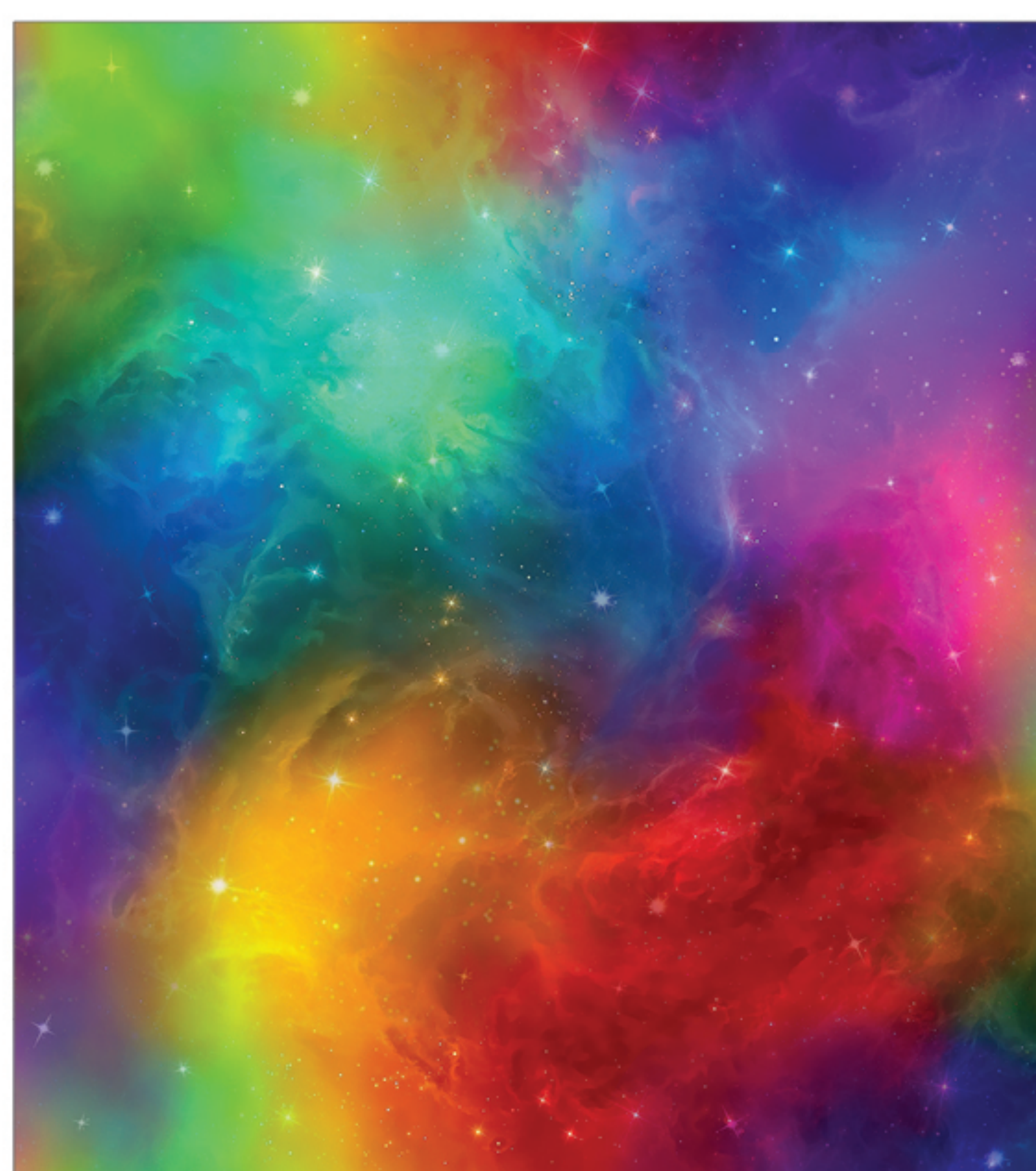
DDC11249 MULTI 3 YARDS

COMMERCIAL PATTERN : WWW.CDM365STUDIOS.COM