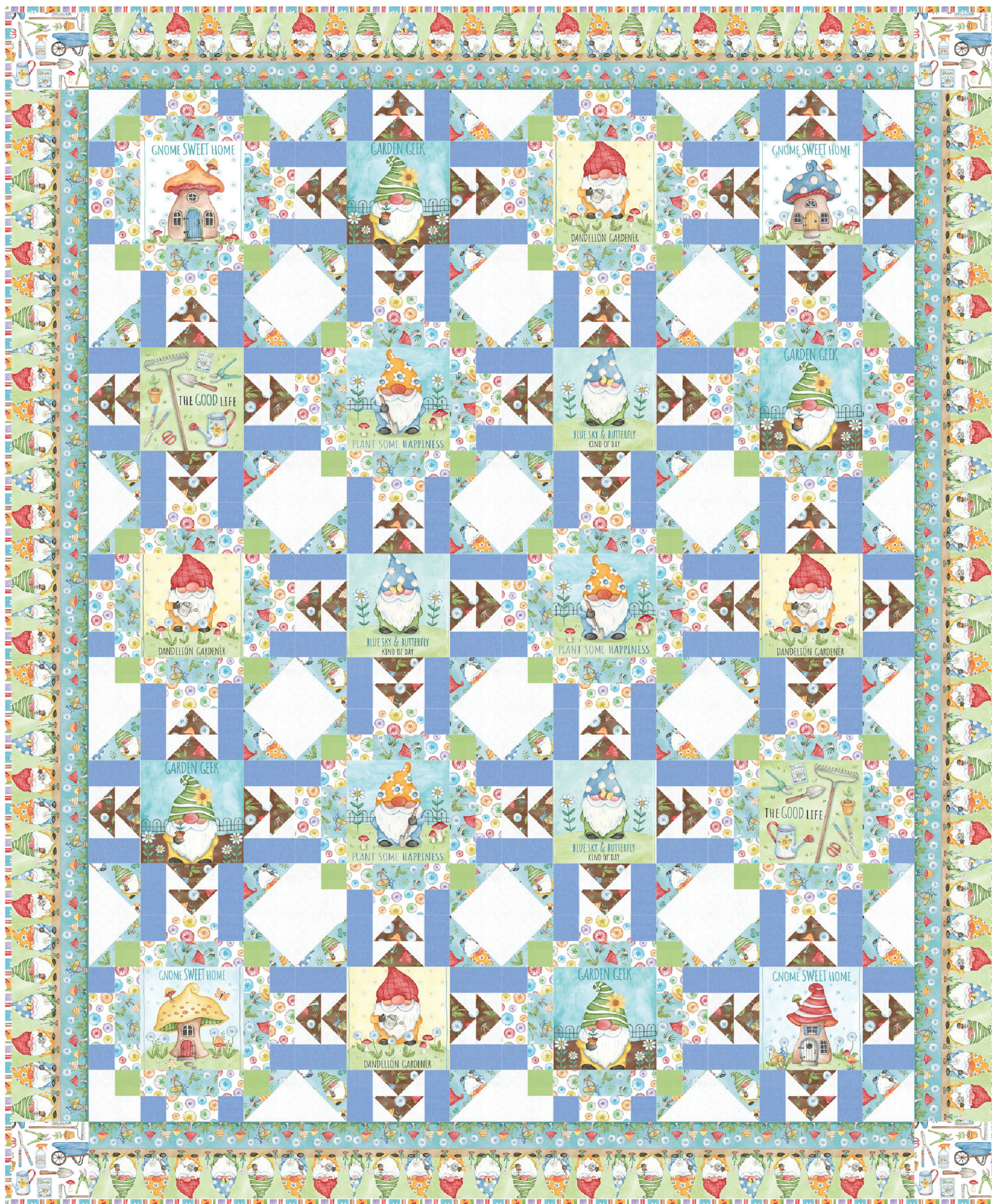
*THIS IS A DIGITAL REPRESENTATION OF THE QUILT TOP. FABRIC MAY VARY.

SIZE: 57"W X 69"H | LEVEL: CONFIDENT BEGINNER | PATTERN BY: PROJECT HOUSE 360