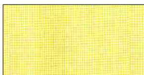
FABRIC B CX7161 Lemon 1 yard