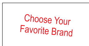
LIGHTWEIGHT FUSIBLE WEB 1-1/2 yards

WOF = Width of Fabric Selvage to Selvage