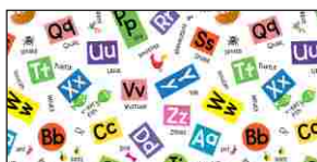
FABRIC F DC10191 White 3 yards (backing)