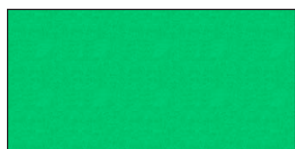
FABRIC E SC5333 Green 3/4 yard (includes binding)