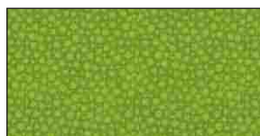
FABRIC C CX6699 Meadow Fat Quarter