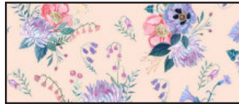
FABRIC F DDC9655 blush 1 3/4 yard