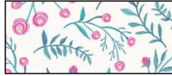
FABRIC C DDC9658 pearl 3/4 yard