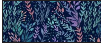
FABRIC B DDC9657 ink 1 1/8 yards