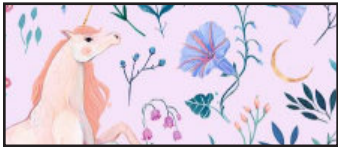
FABRIC E DDC9656 lilac 1/2 yard