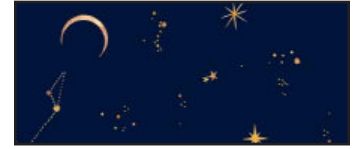
FABRIC D DDC9659 ink 1/2 yard