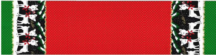
CM8073 Santa Hello, My Deer 1 1/4 yards