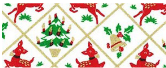
CM8068 White Fawn Frolic 3/8 yard