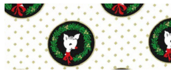
CM8071 White Fawn Laureates 3/8 yard