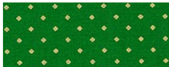
CM8072 Green Diamante Fat 1/8