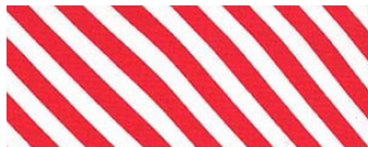
CX8386 Peppermint Sugar Stripe Fat 1/8