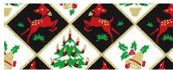
CM8068 Santa Fawn Frolic 3/8 yard