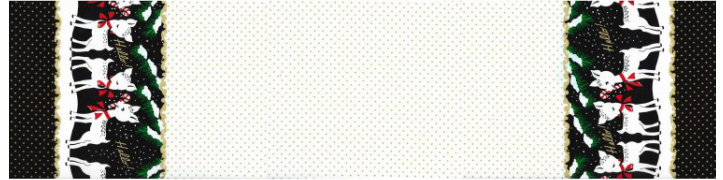
CM8073 White Hello, My Deer 1 5/8 yards