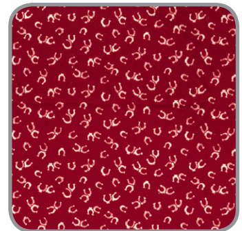
SMP0290 Red Horseshoe