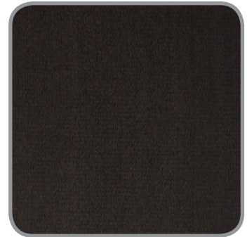
SMS7580 Dark Chocolate Slinky Minky