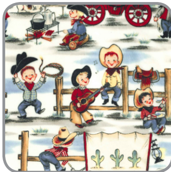
SMP0248 Denim Lil' Cowpokes