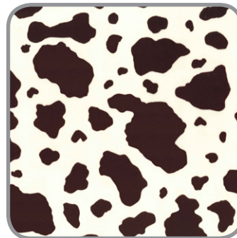
SMP1704 Brown Pony Skin