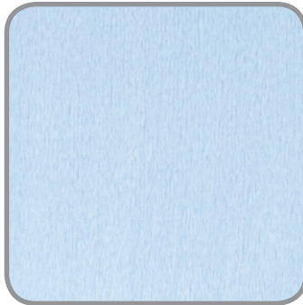
SMS7580 Sky Slinky Minky