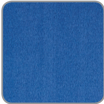
SMS7580 College Blue Slinky Minky