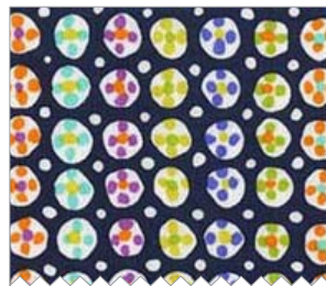
DC6872 Navy Button Spot 1/6 yard