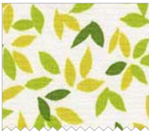
DC6870 Starfruit Little Leaves 1/6 yard