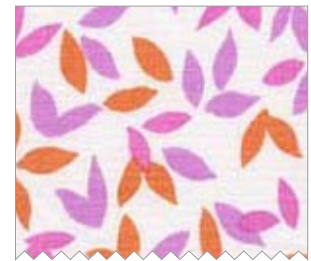
DC6870 Orchid Little Leaves 1/6 yard