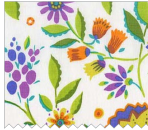
DC6864 Jewel Folk Floral 1/6 yard