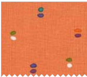
DC6866 Apricot Double Dot 1/6 yard