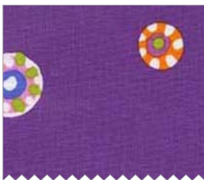
DC6867 Plum Folk Floral Dot 1/8 yard