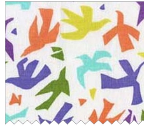
DC6868 Jewel Origami Birds 1/6 yard