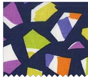
DC6865 Navy Fragments 1/6 yard