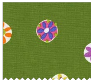
DC6867 Avocado Folk Floral Dot 1/8 yard