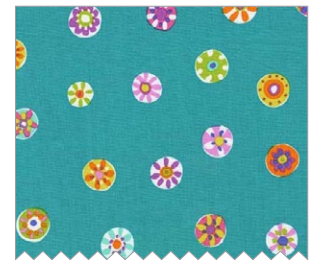
DC6867 Mermaid Folk Floral Dot 1/8 yard