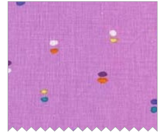
DC6866 Orchid Double Dot 1/6 yard