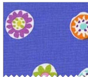
DC6867 Periwinkle Folk Floral Dot 1/8 yard