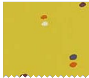
DC6866 Starfruit Double Dot 1/6 yard