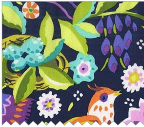
DC6863 Navy Folk Birds 1 yard