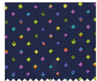
DC6871 Navy Split Diamonds 3/8 yard