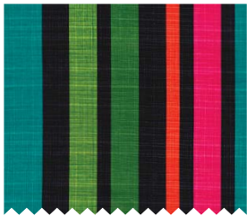
CX6700_MARINE BIG HASH STRIPE 1/2 YARD