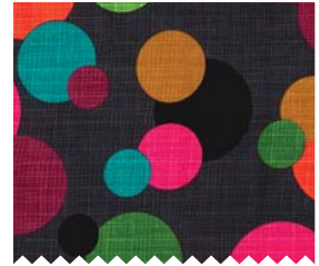
CX6513_MAGENTA IN THE ROUND 1/2 YARD