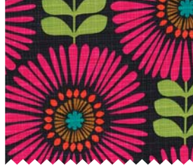
CX6688_MAGENTA FRINGE FLOWERS 1/2 YARD