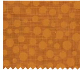
CX6699_AMBER HASH DOT 1/4 YARD