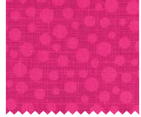
CX6699_MAGENTA HASH DOT 1/4 YARD (3 YARDS BACKING)