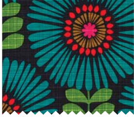
CX6688_MARINE FRINGE FLOWERS 1/4 YARD