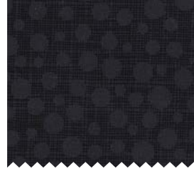
CX6699_CHARCOAL HASH DOT 1 YARD (INCLUDES BINDING)