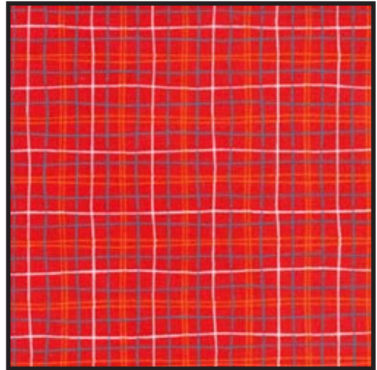
CX4768 Red Lunch Box 1/4 yard