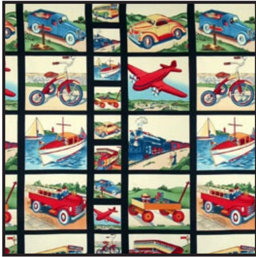
CX2008 Retro Transportation 1 Panel