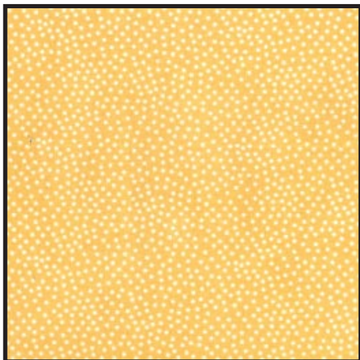
CX1065 Banana Garden Pindot 1/6 yard