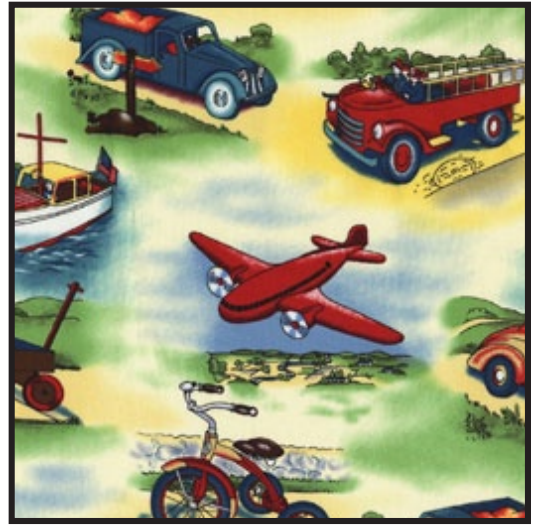
CX2185 Cream Transit 1 1/4 yards