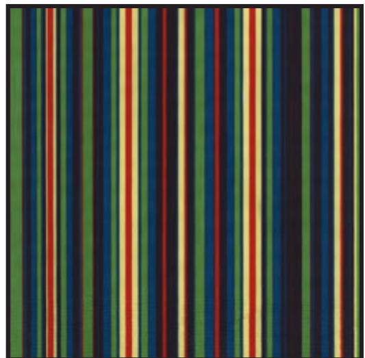
CX3137 Retro Play Stripe 5/8 yard