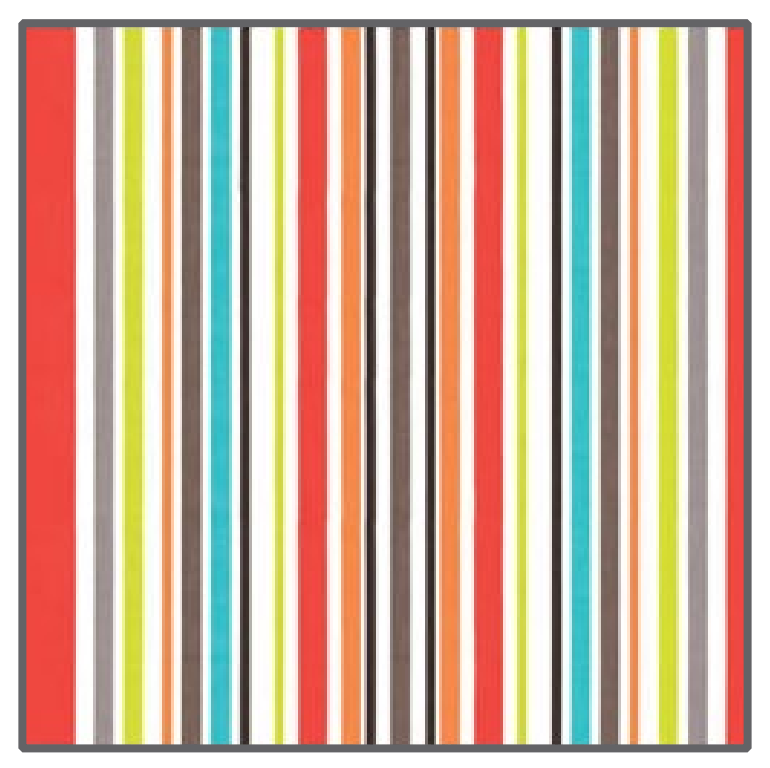
DC5484 Clementine Big Stripe 4 3/4 yards