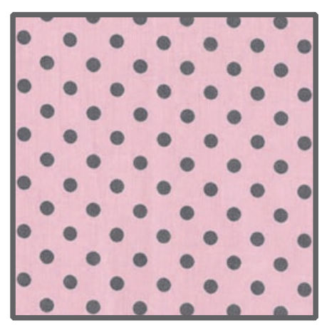
CX2490 Blossom Dumb Dot 1/4 yard