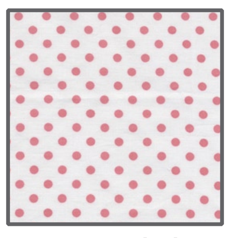
CX2490 Blush Dumb Dot 1/4 yard