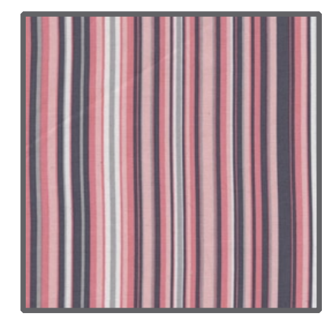
CX3137 Bloom Play Stripe 1/2 yard