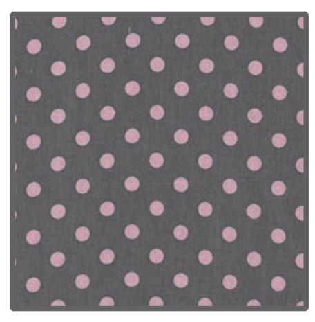
CX2490 Bloom Dumb Dot 1/4 yard