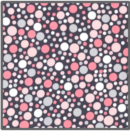
CX3136 Bloom Play Dot 1 1/2 yards