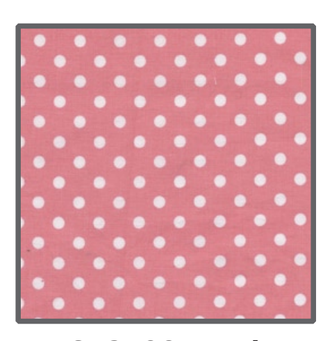
CX2490 Petal Dumb Dot 1/4 yard