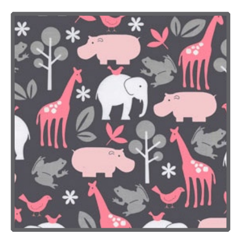
CX4061 Bloom Zoology 1 1/2 yards