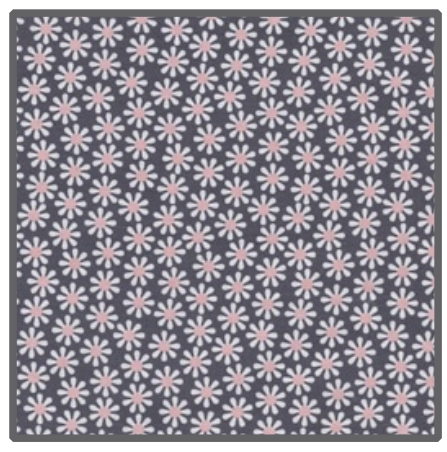
CX2507 Bloom Daisy Flowers 1 1/2 yards