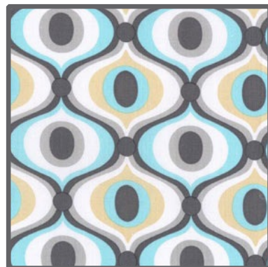
CX3359 Charcoal Feeling Groovy 3/4 yard