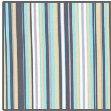
CX3137 Sea Play Stripe 3/4 yard