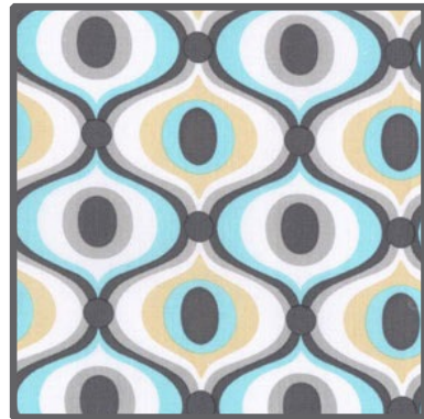
CX3359 Charcoal Feeling Groovy 3/4 yard