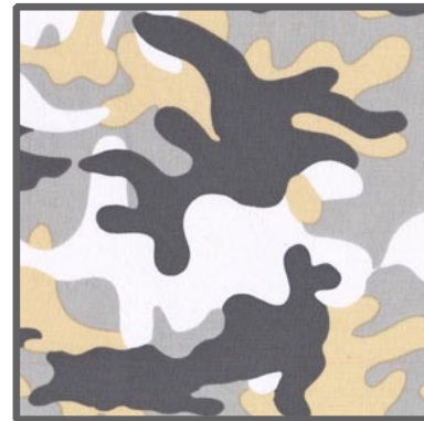
CX3188 Gray Camouflage 5/8 yard