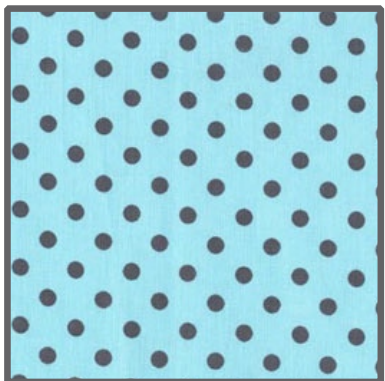
CX2490 Sea Dumb Dot 1/2 yard