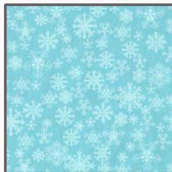
CX4644 Sky Snowfall 7/8 yard