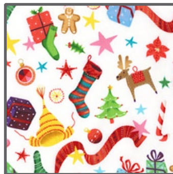
CX4643 Multi Stocking Stuffer 3/8 yard