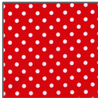
CX2490 Red Dumb Dot 3/4 yard