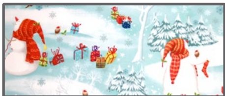
CX4642 Sky Snowman's Land 7/8 yard