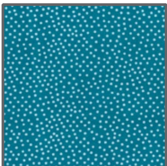
CX1065 Lagoon Garden Pindot 1/4 yard