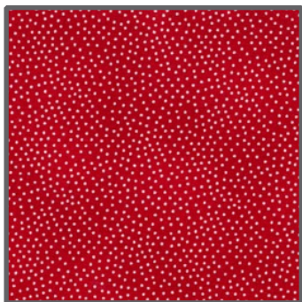
CX1065 Red Garden Pindot 1/4 yard