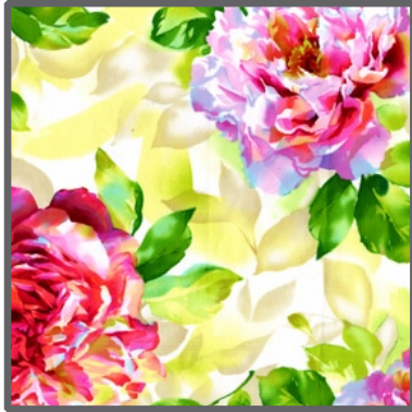
CX4279 Blush Pretty Peony 1 yard