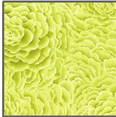
CX4350 Lime Petals 3/8 yard