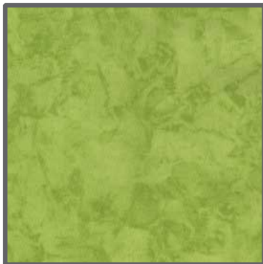
K4058 Krystal 3/4 yard