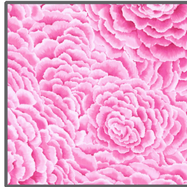
CX4350 Pink Petals 3/8 yard