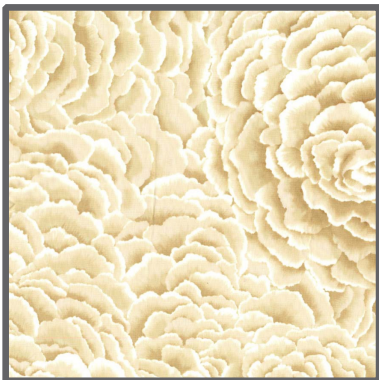
CX4350 Tan Petals 5/8 yard