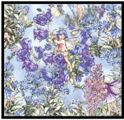
DM3881 Peri Periwinkle Fairies Fat Quarter