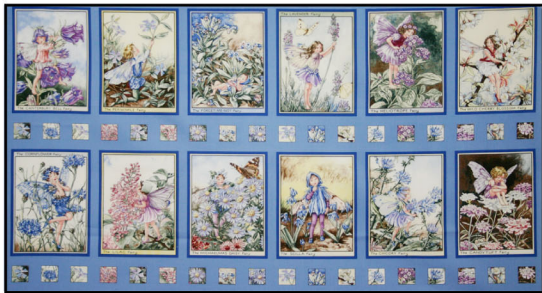
*DC3883 Peri Periwinkle Fairies Panel Full Panel