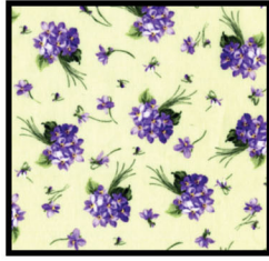
CX3878 Lilac Blossoming Bouquet Fat Quarter