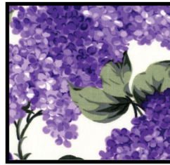
CX3877 Lilac Lovely Lilac Fat Quarter