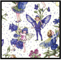
DM3927 Peri Petite Fairies Fat Quarter