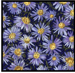
DC3931 Peri Dainty Daisies Fat Quarter