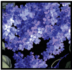
CX3877 Peri Lovely Lilac Fat Quarter