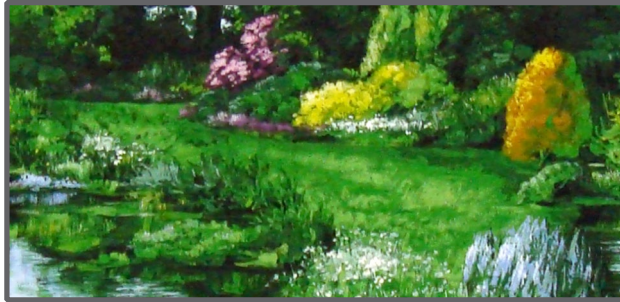
CJ2135 Green Park Landscape 3/4 yard