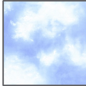
CX2517 Blue Clouds 1 1/4 yard