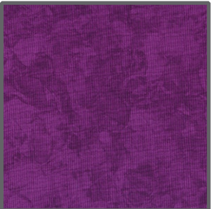
K1274 Krystal 1/8 yard