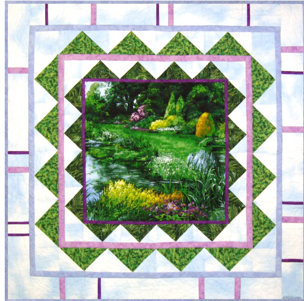
Size: Approximately 50"W x 50"H