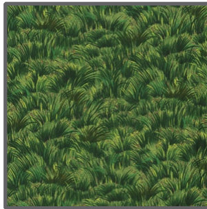
DC4015 Green Lawn 1/2 yard