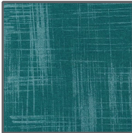
CJ4816 Teal Painter's Canvas 1/2 yard