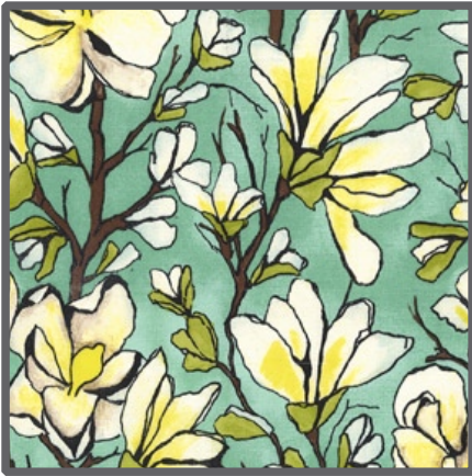
CJ4814 Aqua Magnolia Branch 1 1/4 yards