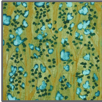
CJ4813 Olive Climbing Blossoms 3/4 yard