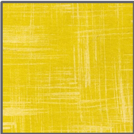
CJ4816 Mustard Painter's Canvas 1 yard