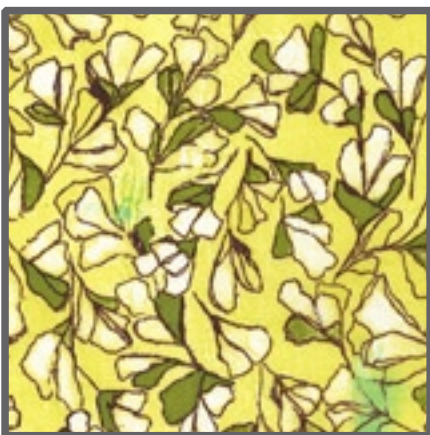
CJ4812 Yellow Scattered Buds 3 yards