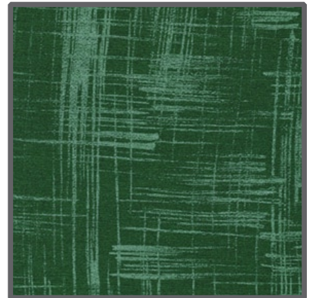
CJ4816 Green Painter's Canvas 1/2 yard