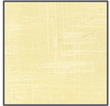
CJ4816 Cream Painter's Canvas 1/2 yard