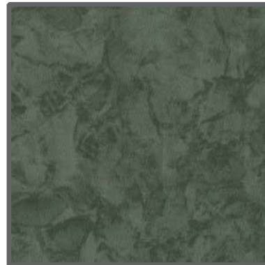
K4152 Krystal 1/3 yard