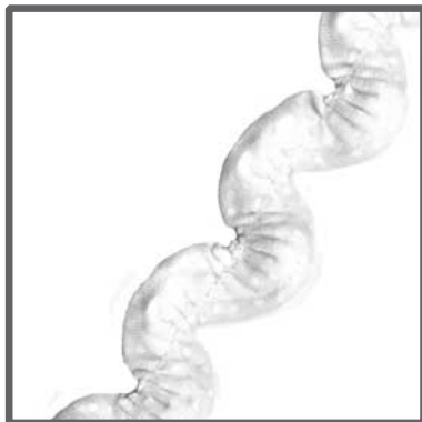
RR1065 Snow Ruffle Rac 4 1/2 yard