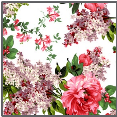
CX4363 White Scented Garden 1 1/2 yard