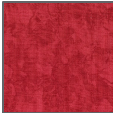
K1145 Krystal 5/8 yard