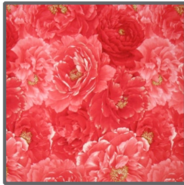
CX4110 Coral Charlotte 1 1/2 yard