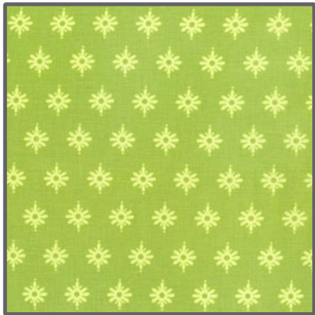
DC4610 Lime Firefly 2/3 yard