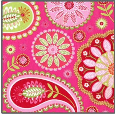
DC4613 Pink Gypsy Paisley 1 1/4 yards