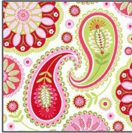
DC4613 White Gypsy Paisley 1 1/4 yards