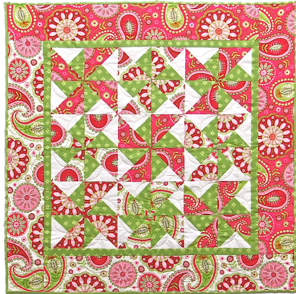
Size: Approximately 39"W x 39"H