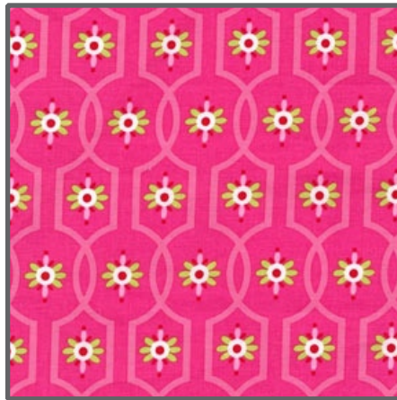
DC4615 Pink Moonflower 1 1/2 yards