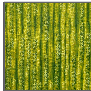
CX4500 Green Cactus Stripe 1 3/4 yard