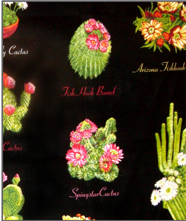
CX4460 Black Cacti 1 1/4 yard