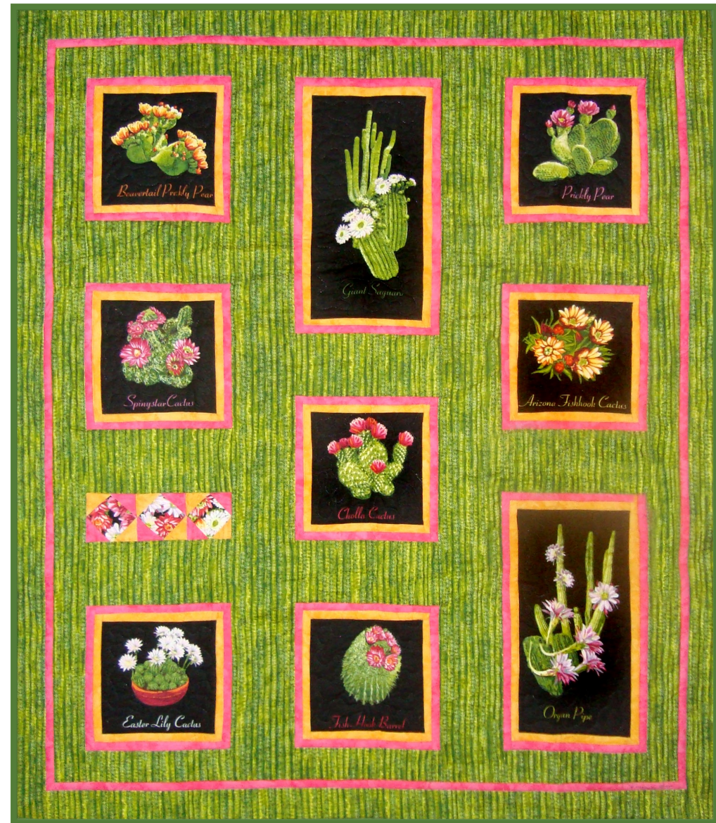
Size: Approximately 44"W x 51"H