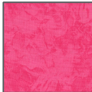
K1035 Krystal 1/2 yard