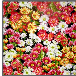
CX4499 Multi Cactus Bloom Fat 1/8