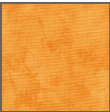
K1122 Krystal (1) Fat 1/4