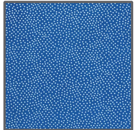
CX1065 Ocean Garden Pindot 1/4 yard