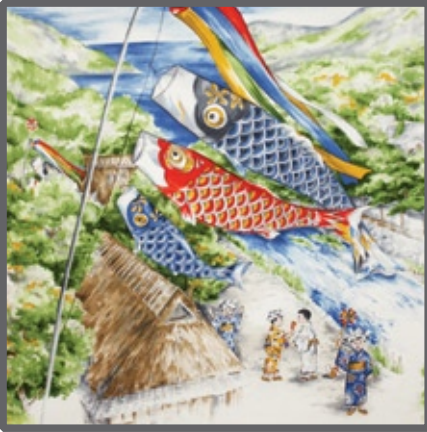
CJ4749 Multi Boy's Day 2/3 yard