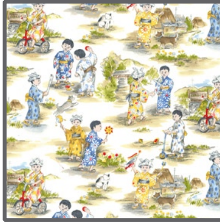
CJ4750 Cream Otokonoko 1 yard