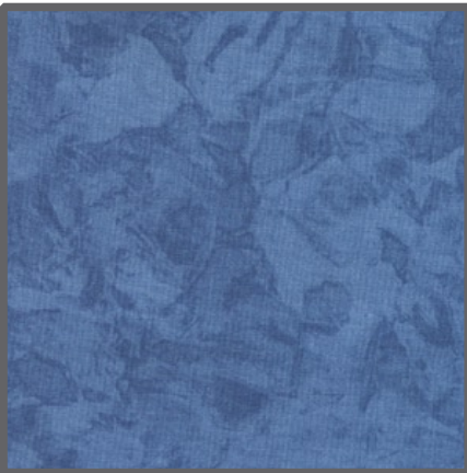
K1164 Krystal 1 yard