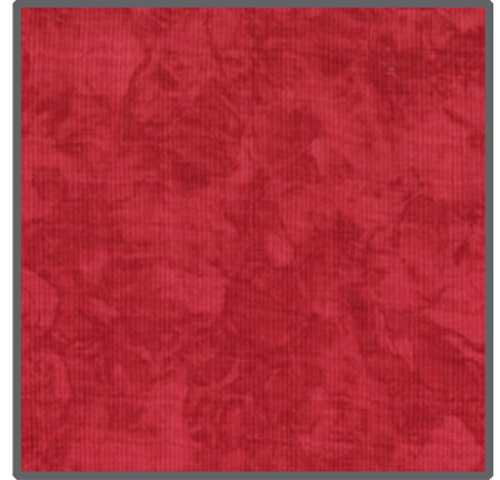
K1145 Krystal 3/4 yard