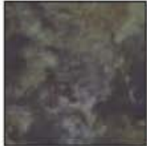
CX3060 Stone Water Spot 6"x 20" piece