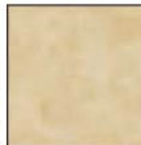
K1005 Krystal 2"x 5" piece