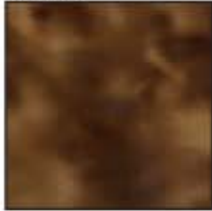
CX1753 Brown Fiesta Texture 1/4 yard