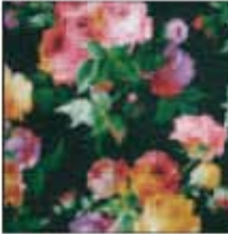
CX3260 Black Rose Devine Fat Quarter