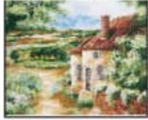
CX3361 Green Chateau Road 5/8 yard