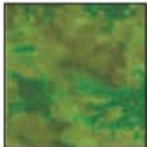
CX3060 Moss Water Spot 4"x 4" piece