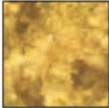
CX3060 Yellow Water Spot 12"x 8" piece