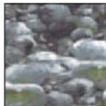
CX2932 Gray Just Rocks 3"x 5" piece