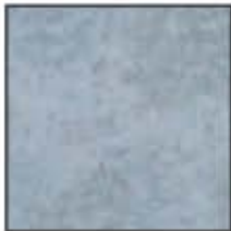
CM0376 Silver Fairy Frost 8"x 6" piece