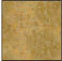
CM0376 Gold Fairy Frost 1/8 yard