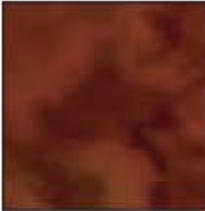
CX1753 Rust Fiesta Texture 4"x12" piece