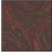
CX1087 Sienna Marble 3/4 yard