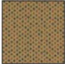
CX3164 Tobacco Stitch Diamonds 16"x12" piece