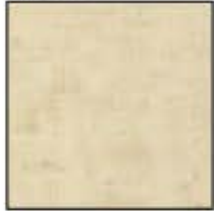
CX0239 Vanilla Countertop Texture 3/8 yard