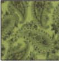
CX3197 Pistachio Peggy Paisley 1/2 yard