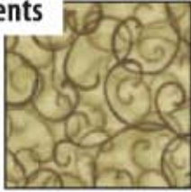
CX2801 Khaki Scroll Swirls 7/8 yard