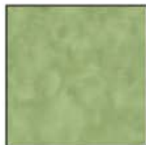
K1053 Krystal 4"x 5" piece