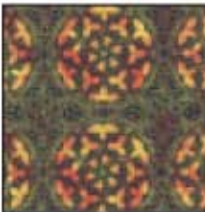
CX3214 Sun Medieval Medallions 4"x 4" piece