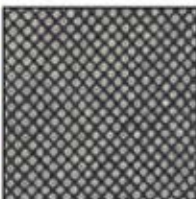
CX2819 Black Shibore Texture 1/8 yard