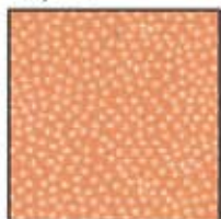
CX1065 Tangerine Garden Pindot 8"x8" piece