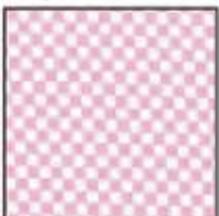
CX2781 Pink Tiny Check 1/8 yard