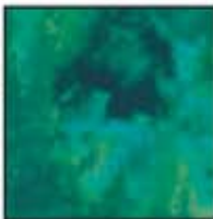
CX3060 Meadow Water Spot 1/4 yard