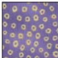
CX0274 Purple Giddy Dot 1/8 yard