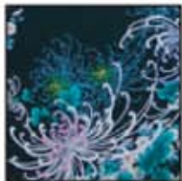
CX3306 Black Kyoto Mumms 3/4 yard