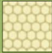
CX2879 Maize Seeds Fat quarter