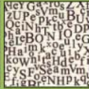
CX3155 Cream Word Search Fat eighth