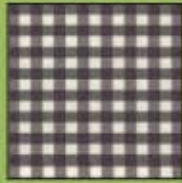
CX3248 Cream Kid Check 3/8 yard