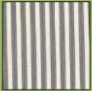
CX2899 Brown Ticking Stripe Fat eighth