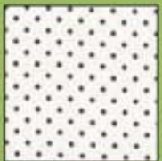
CX3218 Cream Kitschy Dot 1/6 yard