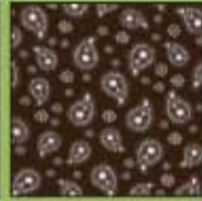
CX3195 Brown Polly Paisley Fat eighth