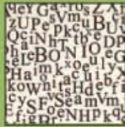
CX3155 Cream Word Search Fat eighth