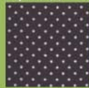
CX3218 Kitschy Dot Brown 5/8 yard