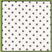
CX3218 Cream Kitschy Dot 1/6 yard