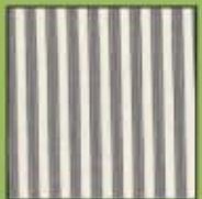
CX2899 Brown Ticking Stripe Fat eighth