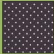
CX3218 Kitschy Dot Brown Fat quarter