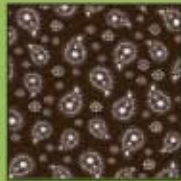
CX3195 Brown Polly Paisley 1/8 yard