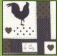
CX3219 Brown Kitschy Chicky 1/4 yard

Placemats (2) Finished Size: 13-1/2" x 18-1/2"