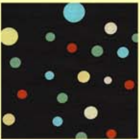
CX1338 Black Party Dot 3/8 yard