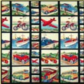
CX2008 Retro Transportation 5/8 yard (2 complete rows)