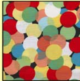
C1400 Retro Spotlight 1/2 yard