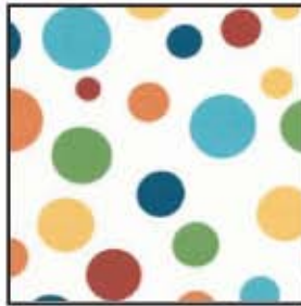
CX3295 Play Lollidot 1 yard