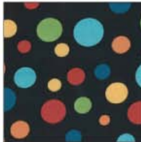
CX3295 Retro Lollidot 1-1/2 yard