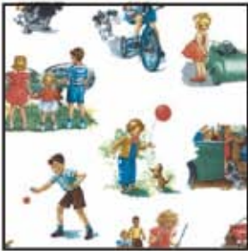
DJ3216 White Dick and Jane All Over 1 yard