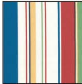
CX0323 Play Stripe 1-1/4yard