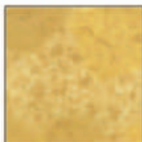
CM0376 Honey Fairy Frost 5" x 2" piece