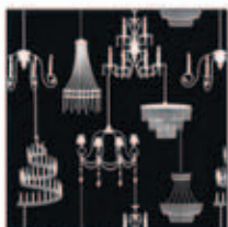
CX3040 Black Lovely Lighting 2 yards