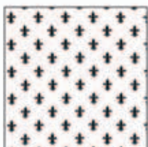
CX3030 White Fleur Allover 3/4 yard