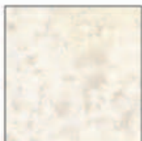
CM0376 Natural Fairy Frost 7 1/2" x 3 1/2" piece