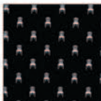
CX3032 Black Sitting Pretty 1 yard