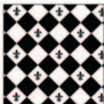
CX3044 Black Fleur Check 1 1/4 yard