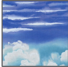
CX0035 Peri Sky 1/2 yard