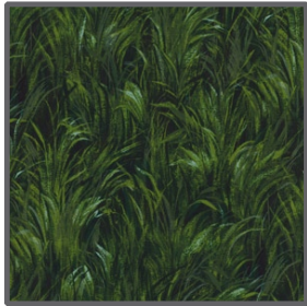
CX3071 Green Meadow Grass 1/2 yard