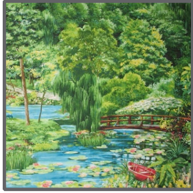
DC4169 Green Summer Day 2/3 yard