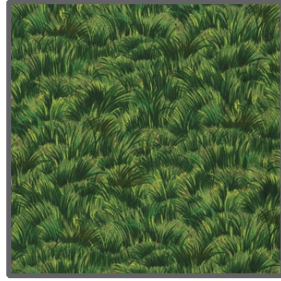
DC4015 Green Lawn 3/8 yard