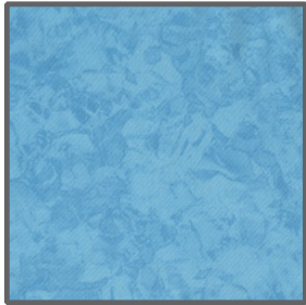
K1160 Krystal 1/4 yard