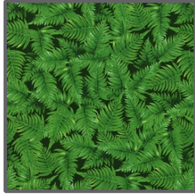
DC4172 Green Summer Fern 3/8 yard