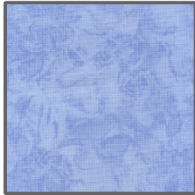
K1063 Krystal 1/4 yard