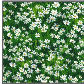
CX3072 Green Meadow Daisy 1/6 yard