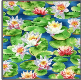
DC4170 Multi Summer Lilies 1/4 yard