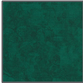
K1257 Krystal 5/8 yard