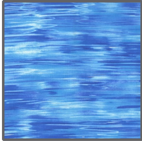
DC3944 Blue Water 1/8 yard