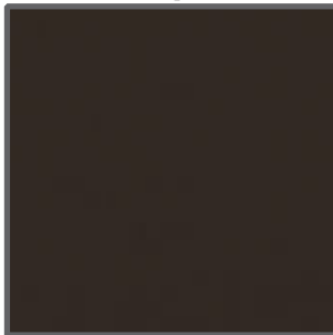
Jet Brown 3/4 yard