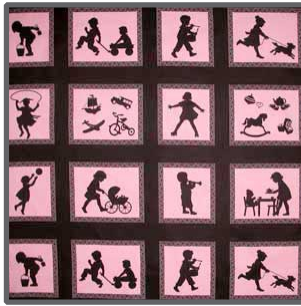
CX3825 - Pink Silo Kids Vignettes 1/4 yard