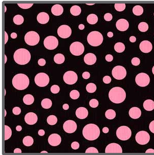
CX3295 - Cocoa Lolli Dot 1/8 yard