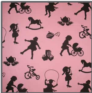
CX3820 - Pink Girls Play 3/4 yard