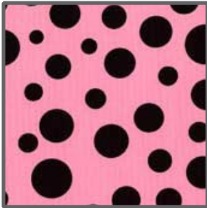
CX3295 - Pink Lolli Dot 1/4 yard