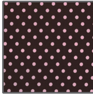
CX2490 - Cocoa Dumb Dot (1) Fat 1/8