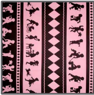
CX3824 - Pink Silo Kids Border 1 yard