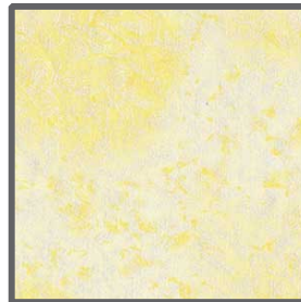
CM0376 Butter Fairy Frost 7/8 yard