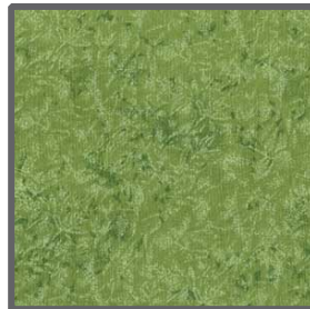
CM0376 Celadon Fairy Frost 3/4 yard