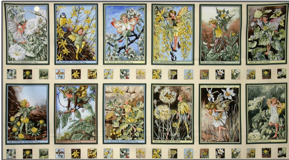
DC3872 Sunny - Sunshine Fairies Panel Full Panel