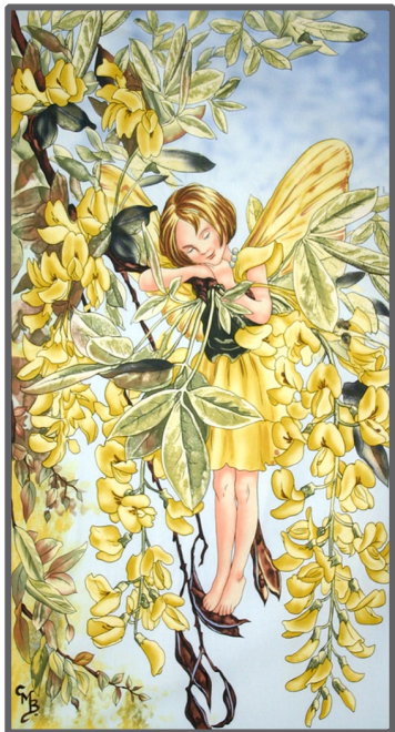
DC3932 Sunny Sunshine Full Panel