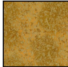
CM0376 Gold Fairy Frost Fat 1/8th