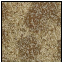
CM0376 Latte Fairy Frost Fat 1/8th