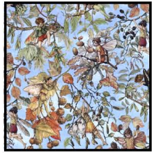
DM3988 Autumn Petite Autumn Fairies 1 yard