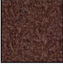
CM0376 Sepia Fairy Frost Fat 1/8th