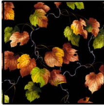
CX4026 Brown Autumn Vines 3/4 yard