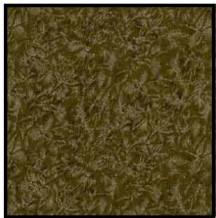
CM0376 Fern Fairy Frost 1/4 yard