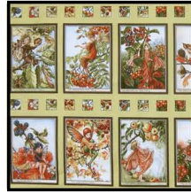
* DC3975 Autumn Autumn Fairy Panel 2/3 yard