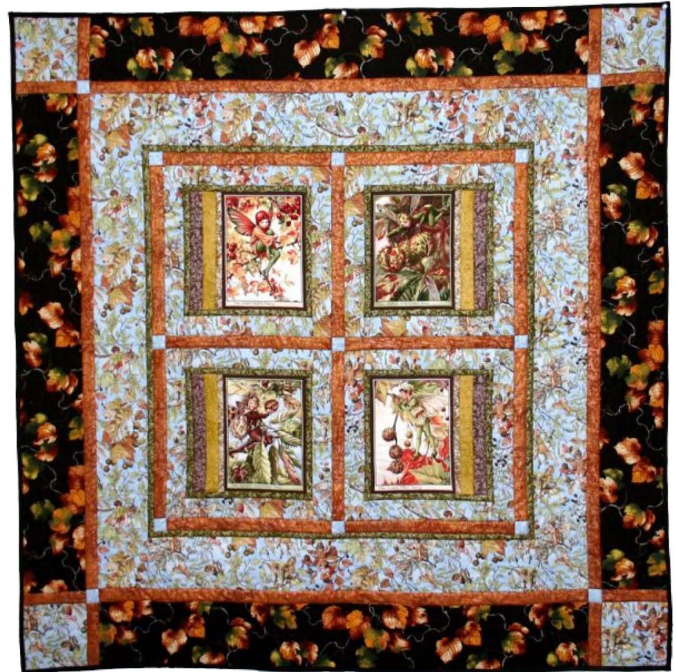
Quilt is approximately 50" X 50"