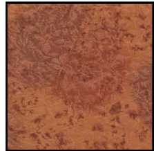
CM0376 Coin Fairy Frost 1/2 yard