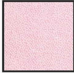
CX1065 Girl Garden Pindot 1/4 yard