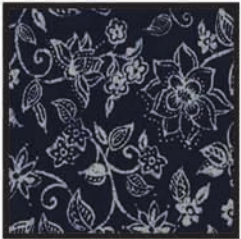
CX3577 Indigo Geraldine 1/4 yard