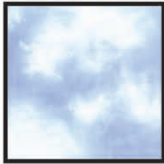
CX2517 Blue Sky 1/4 yard