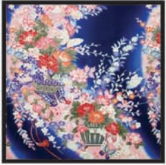
CX3314 Blue Osaka Blossom 3/4 yard