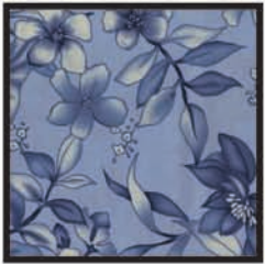
CX3580 Indigo Gwenyth 1/4 yard