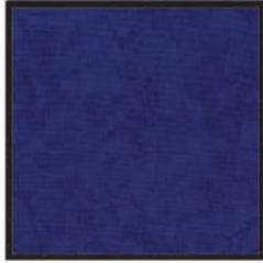
K2265 Krystal 1-1/4 yards