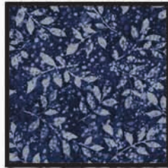
CX3645 Indigo Tonal Leaf 1/4 yard