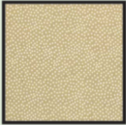
C1065 Latte Garden Pindot 5/8 yard