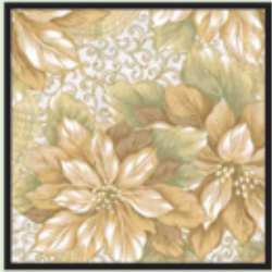
CM3625 Cream Poinsettia Ribbons 1-1/4 yards