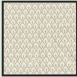
CM3473 Cream Fa La La La 7/8 yards