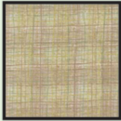
CM3471 Cream Festive Plaid 7/8 yard