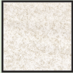
CM376 Twinkle Fairy Frost 5/8 yard