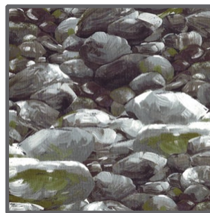
CX2932 Gray Just Rocks 1/4 yard