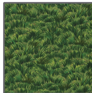
DC4015 Green Lawn 3/8 yard