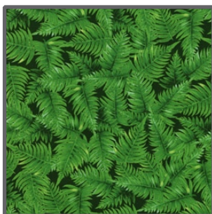
DC4172 Green Summer Fern 1/2 yard