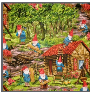
DC4245 Multi Handy Gnomes 1 1/4 yard