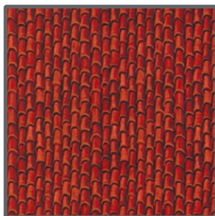
CX4251 Rust Roof Tiles 3" x 15" piece