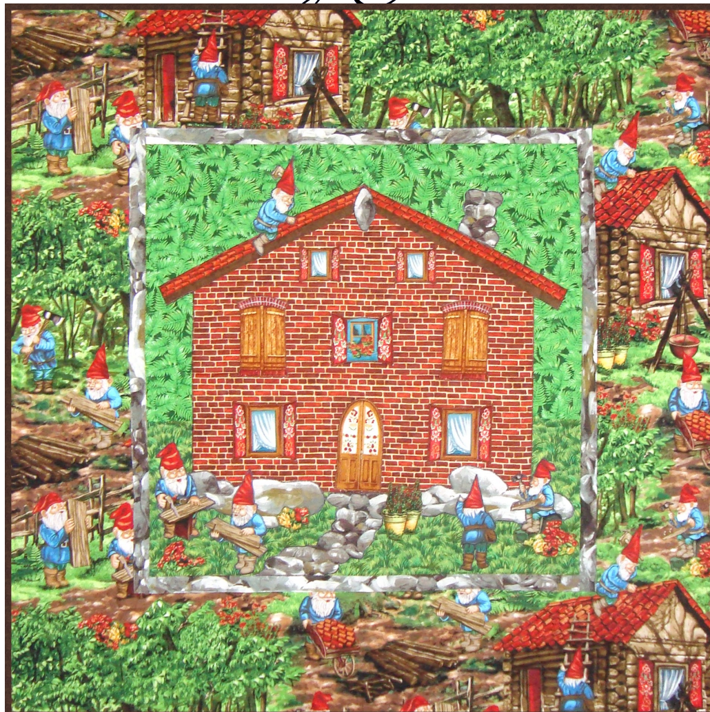
Size: Approximately 42"W x 42"H