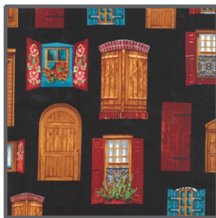
CX4248 Black Doors & Windows 1 yard