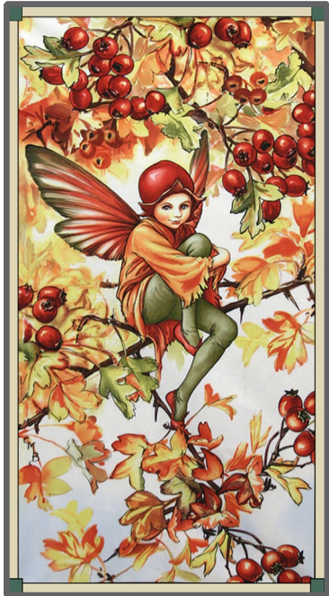
DC3986 Autumn The Hawthorn Fairy Full Panel*