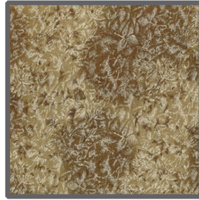
CM0376 Latte Fairy Frost 3/4 yard