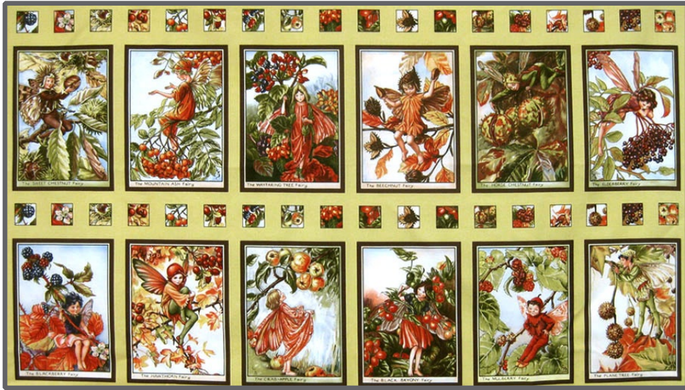
DC3975 Autumn - Autumn Fairies Panel - Full Panel*