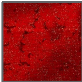
CM0376 Hollyberry Fairy Frost 1/6 yard