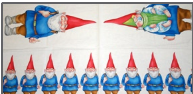
CX4332 Multi Gnome Panel 3/8 yard