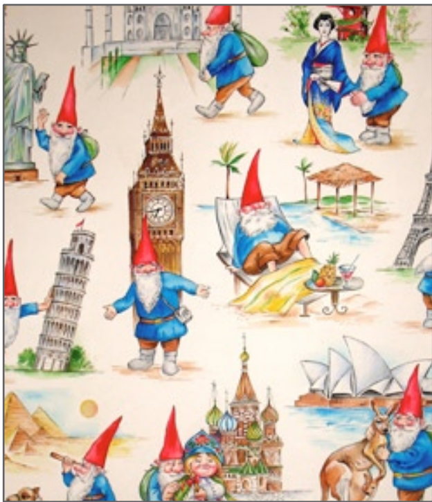
CX4284 Multi Gnome Some Traveler 1 yard