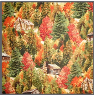
DC4045-Autumn Forest Cabins 1/2 yard