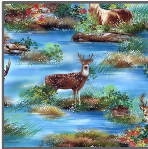
DC4048-Blue Deer Lake Fat 1/4