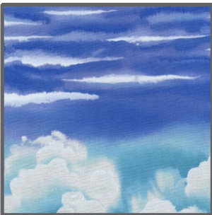
CX0035-Peri Sky 3/8 yard