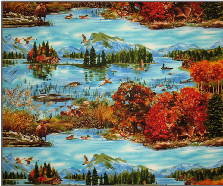
DC4044-Blue Autumn Lake 3/4 yard