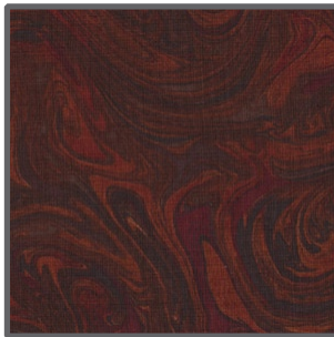
CX1087-Sienna Marble 3/8 yard