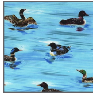
DC4047-Blue Loons 1/4 yard